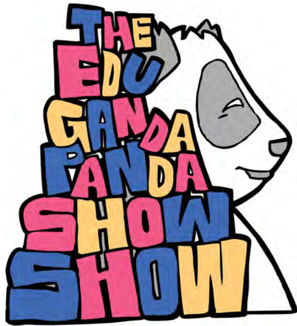
The Eduganda Panda Show Script, dialogue, illustrations and animation for 'The Eduganda Panda Show' screened on 'The Music Jungle' on Channel 9 Australia.