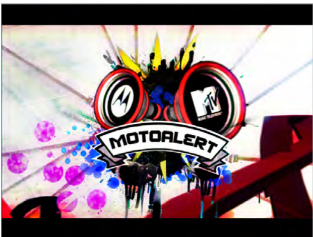
MTV Asia New logo and show packaging for MTV Asia's 'Motoalert'.