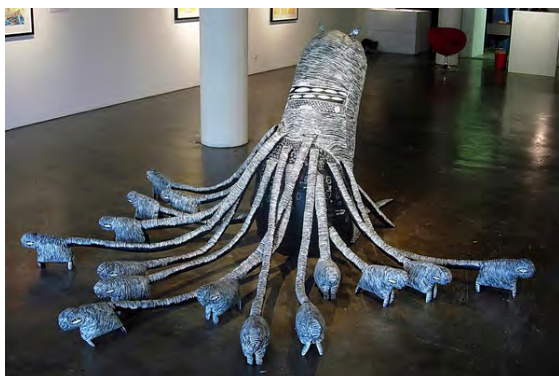
Mother of all evils 2008 3150mm x 2470mm Synthetic polymer paint on vinyl

52 Fitzroy Street St Kilda, Victoria Australia