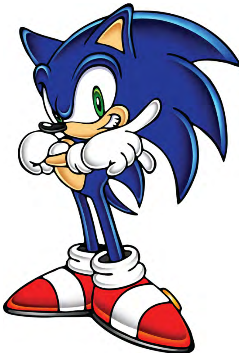
Sonic the Hedgehog © SEGA