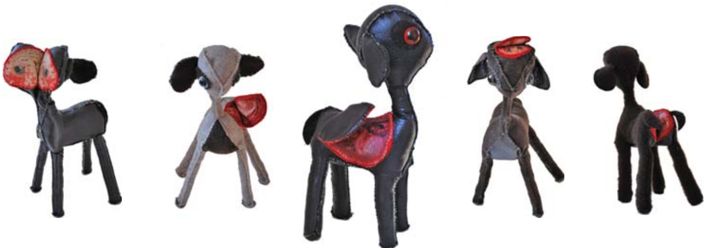
(above, series left to right)