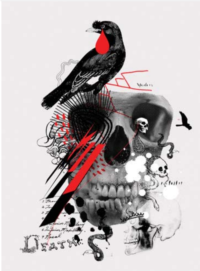
Ju$t Another Rich Kid, Fall/Winter 2008, garment designs.