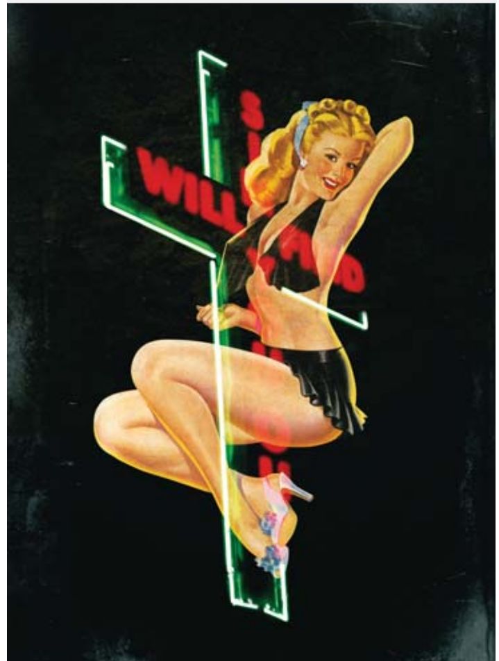
Bluu Birmingham, interior graphics and print campaign.