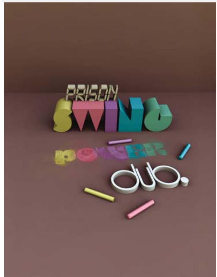
(above) Ministry of Sound, Saturday Sessions May - July 2008.