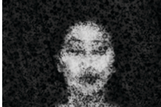
bottom Wren Small Stories (Art)